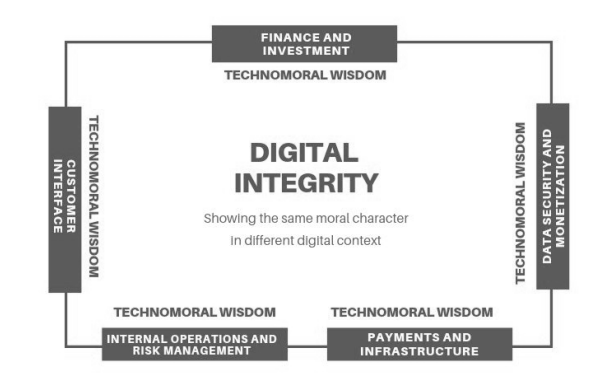
Figure B - Digital Integrity in Fintech

Figure B illustrates this dynamic interaction.