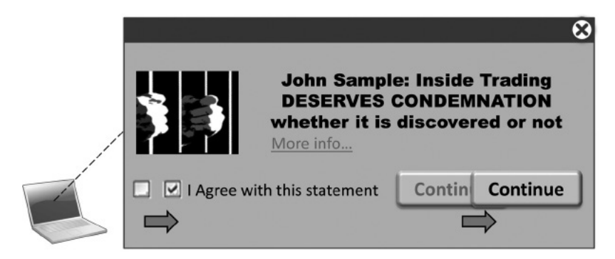
Figure 2 . Pop-up message during a computer process

The pop-up message freezes the of the decision maker's computer processes. He would only be able to resume the activities if he marks the box indicating agreement with the value judgment that inside trading "deserves condemnation". It is only after this positive and communicative action that the "continue" button